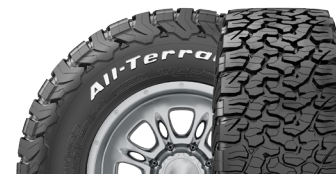
BFGoodrich® All-Terrain T/A® KO2